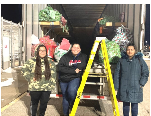
These Independence students helped fill the truck with presents.

Every day we do our best to ensure our students have everything they need to be successful. We want them to know they are cared for, that they matter, that they can achieve anything they are willing to work hard for, and that our school and community are here to support them.